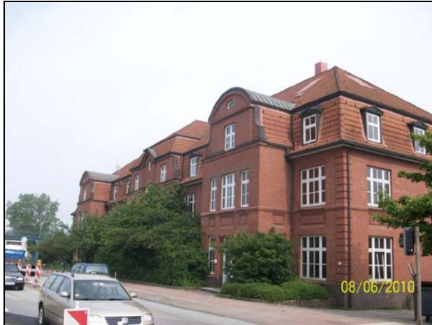
Veddeler Damm 14 before construction start in summer 2010

As part of a very short planning and realization period Contelos Engineering GmbH has been commissioned early 2010 with the project control of the overall project and with the technical consulting to all other infrastructural issues related to the stock and the property.