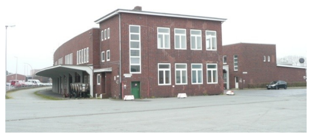
Fish processing factories before start of construction

On account of restricted means a strict cost control and the observance of a cost upper limit is to be guaranteed at the rate of gross 7.02 million EUR by the Contelos Engineering GmbH which was instructed at the tender phase with the projectmanagement as well as with the appropriations management.